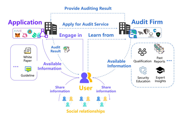
Fig. 3: The framework for Web3 auditing encompasses stakeholders, information exchange, and interactive behaviors. Web3 audit firms engage with users in the Web3 ecosystem by providing auditing services to applications and disseminating security information. These information revelation changes can potentially influence users' security awareness and decision-making processes [49].

other security information disseminated by audit firms reach users, potentially affecting their awareness and behaviors, such as decision-making. These user behaviors, in turn, exert influence on the Web3 ecosystem.