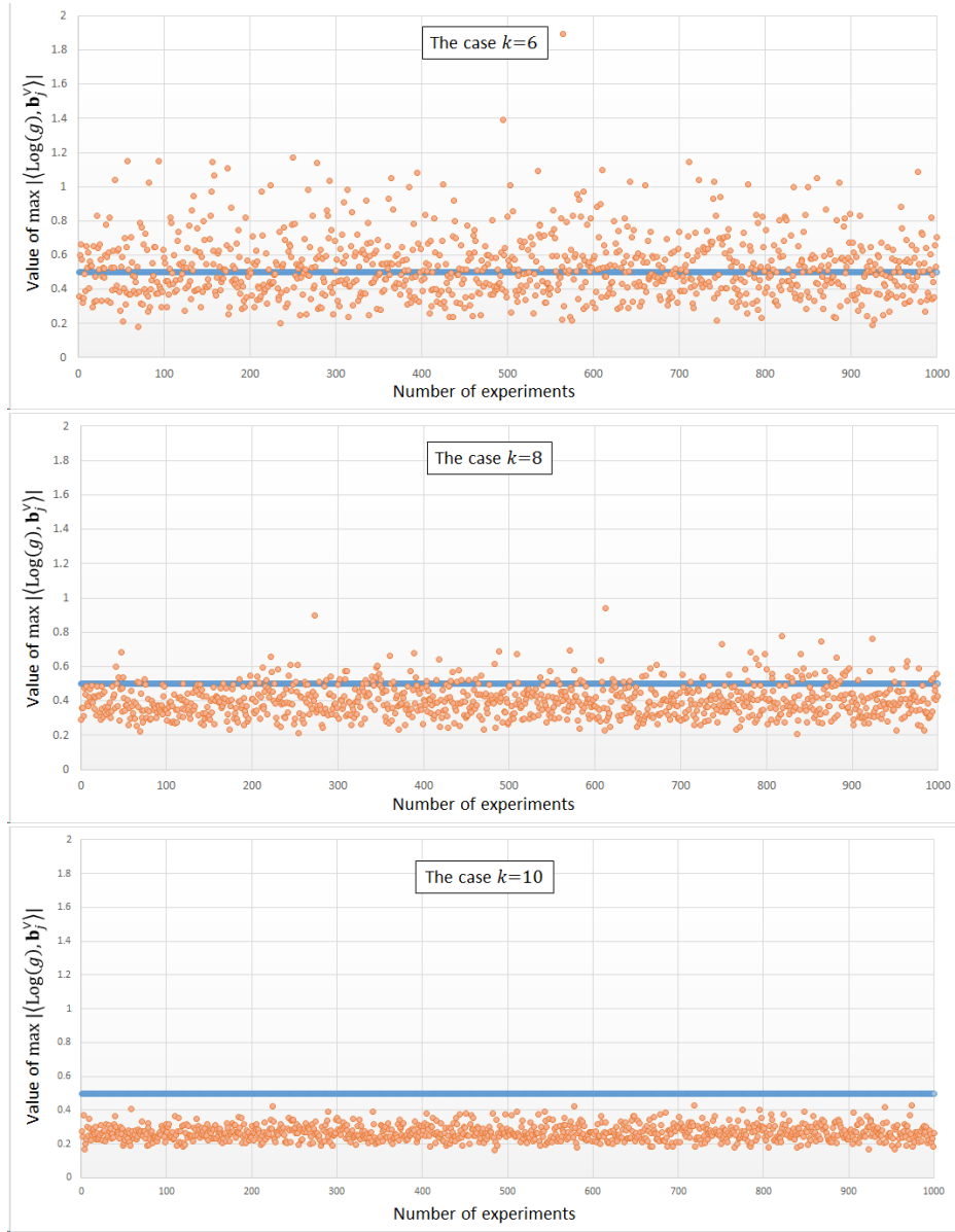
Fig. 3. Same as Figure 2, but g is generated by a uniformly random distribution